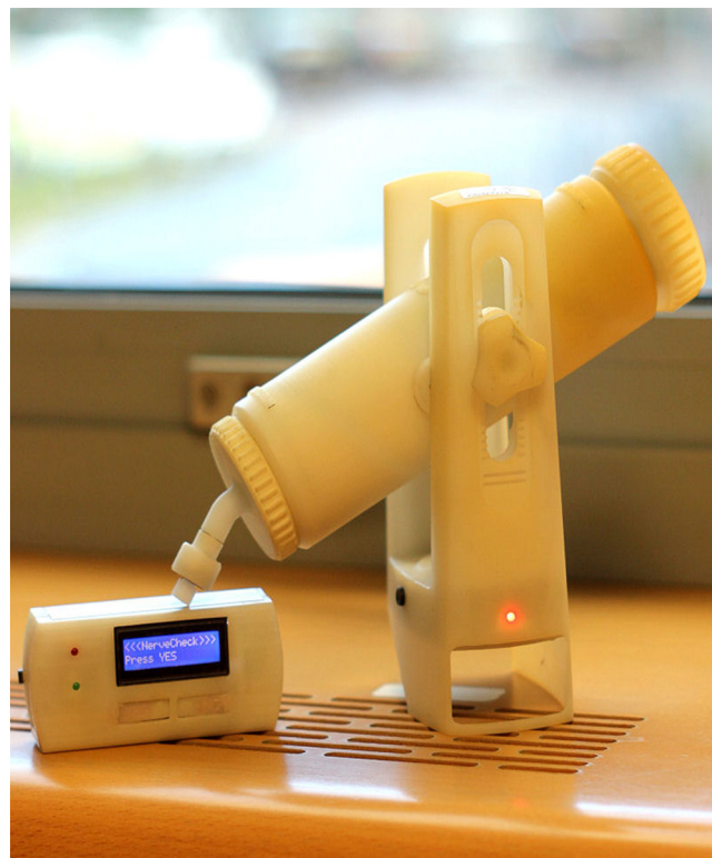
Fig. 1 – NerveCheck is a portable inexpensive ($500) quantitative sensory device designed to assess vibration (VPT), cold (CPT), warm (WPT) perception threshold and heat pain threshold (HPT). Its size is 9.5 cm × 6.1 cm × 23.6 cm and weights only 325 g including battery. Its output is categorical in terms of degree of abnormality. The test takes from 3 to 10 min, depending on whether it is a single test or series of tests.

The participants in the study were recruited from the Manchester Diabetes Centre, Manchester Royal Infirmary in Manchester, UK. The study was performed at the NIHR Wellcome Trust Clinical Research Facility between 7 January 2013 and 19 September 2014. Exclusion criteria included subjects with communication disorders, cognitive deficits, severe anxiety, severe depression or history of neuropathy due